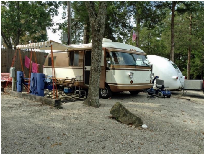
Beau and Turkel at 2015 Branson Ultra Van Rally