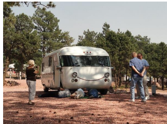
#480 & Inspection team