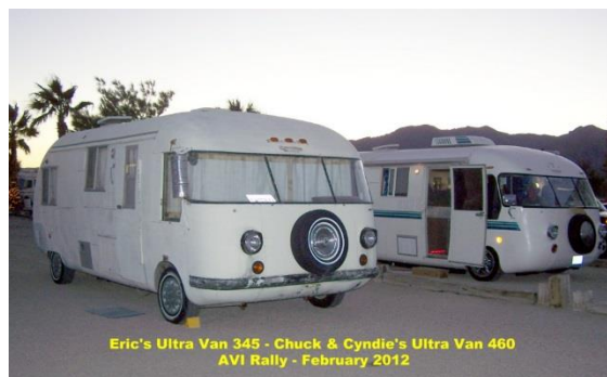
Eric's Ultra Van 345 - Chuck & Cyndie's Ultra Van 460 AVI Rally - February 2012