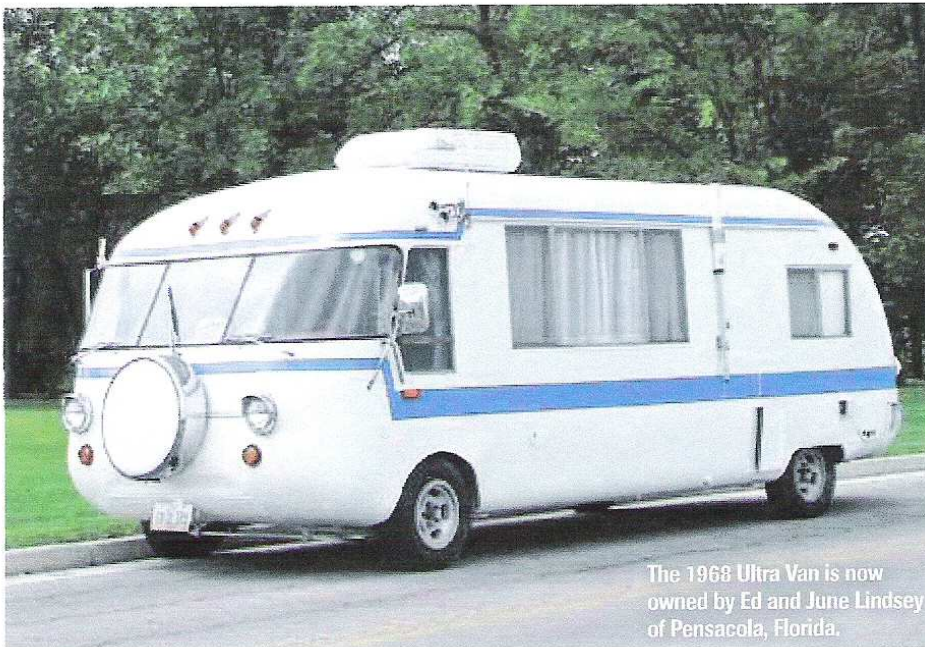
The 1968 Ultra Van is now owned by Ed and June Lindsey of Pensacola, Florida.

Lightweight ultra van of the future sets up camp on the web