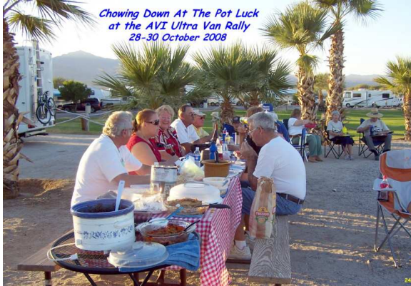
Chowing Down At The Pot Luck at the AVI Ultra Van Rally 28-30 October 2008

The site of the event was the AVI Casino RV Park. The RV Park folks put us in a open area from the regular customers and that worked out fine. Lots of people from the park came to look over all of the "classic" RV'S.