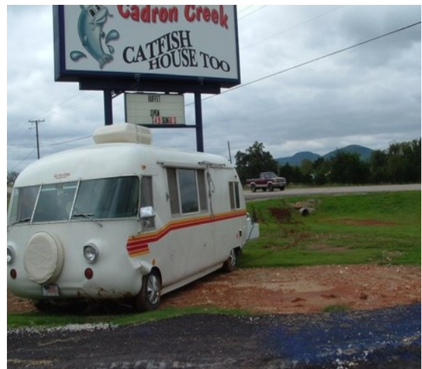
At rest after being pulled out