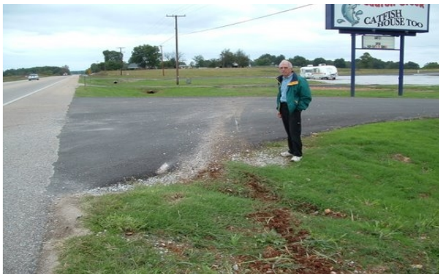
The Path to destruction