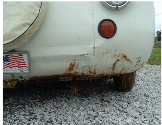
A tough front end