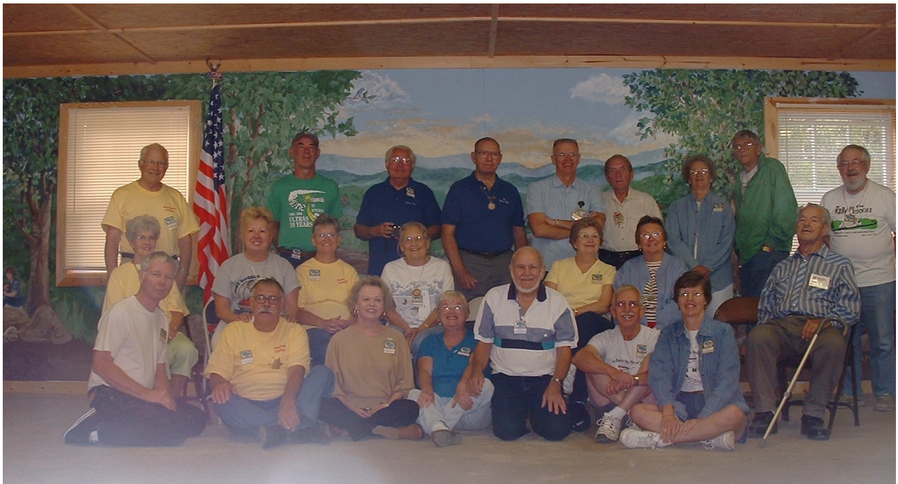
In the pickin' barn