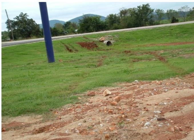
The Pole I almost hit!!!!