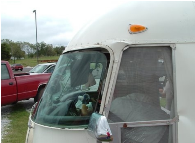
The hard way to remove a windshield