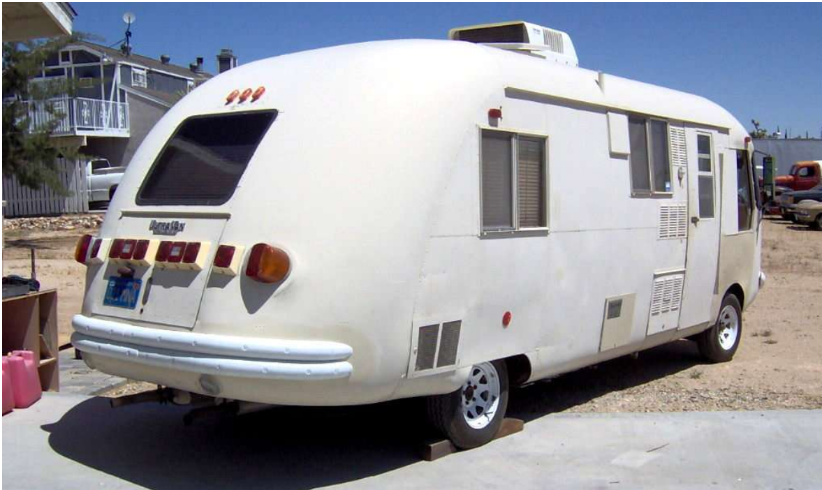
New Bumpers Installed

When I was in the bathroom to repair the plumbing, I decided to repaint this moldy old lime green shower with gloss ivory white for more lighting ambiance.