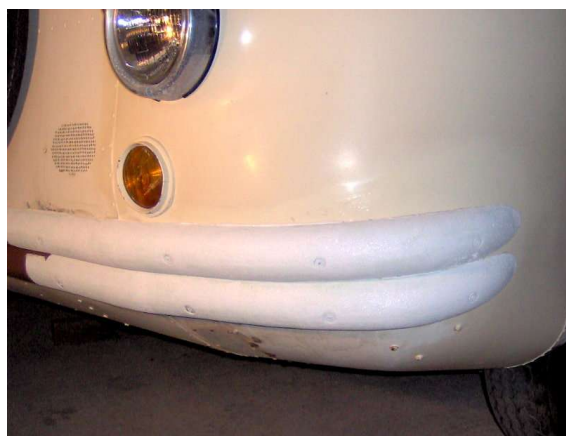
New Bumpers before and after painting.