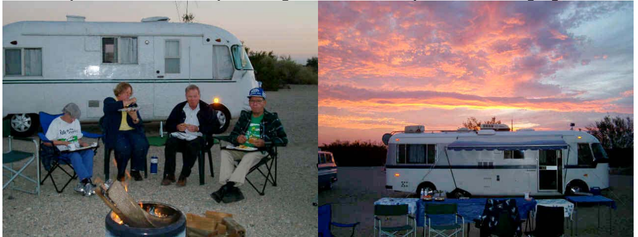
After service, dinner on the prairie.....and a beautiful sunset