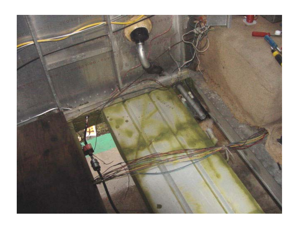
#350s Modified Fuel Tank Inlet

Folks, Don't get concerned about the wires in the picture getting crushed under the floor board. The wires actually run over on top of the plywood, under the carpet pad and are taped down flat so that they can't be felt under the carpet pad. Every wire in 350 is new, and all the driving critical ones, easily accessible. I had the entire floor out and all the tanks out when I did this the tank inlet mod, The wires have been in place under the carpet ffor 10 years maybe?