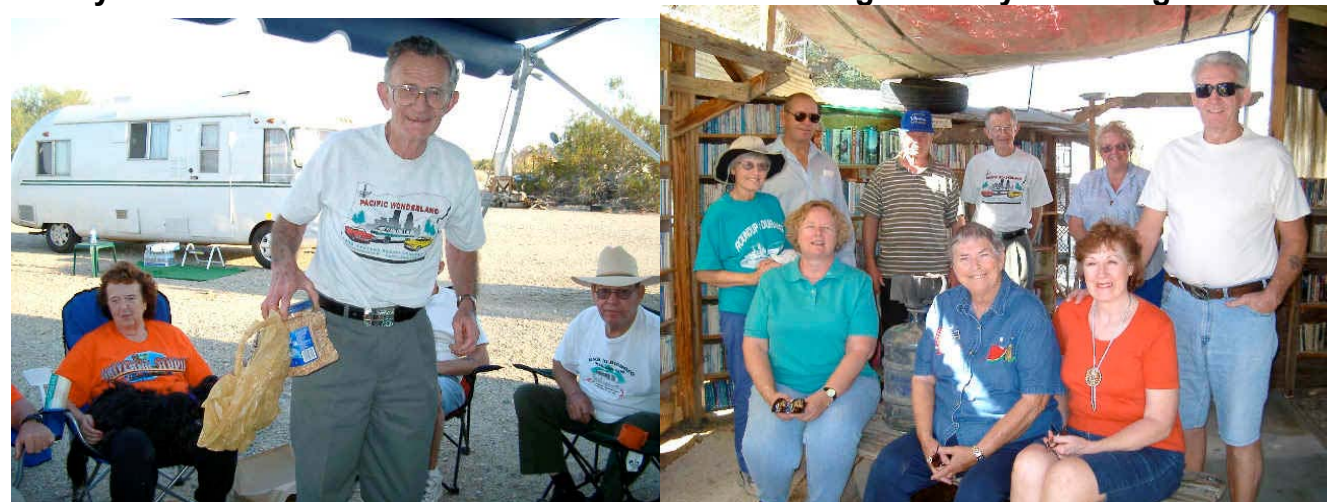
The preacher at the camp meeting.....would speak to his congregation