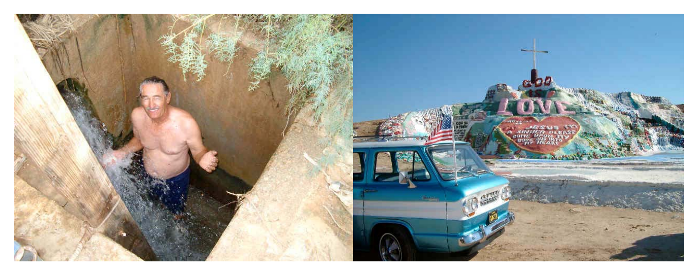
If you looked in a hole and saw this.....it might drive you to religion