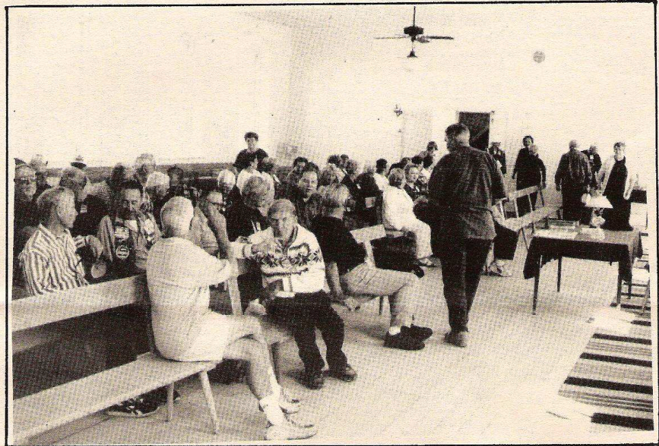
Part of the group of 60 plus Ultra Van MCC members who attended the year 2000 National Rally are shown here in the Amana Church. Notice that the men are sitting on the right side of the hall and the women are sitting on the left side, just the way that church members were required to do back in the last century.

Would you like to see your Ultra Van on the cover of Whales on Wheels? Then send in a photo, with a short story. The photo should have some artistic value featuring the Ultra Van in a good location. Send your photos and stories to the Editor and have your Ultra Van be a star!