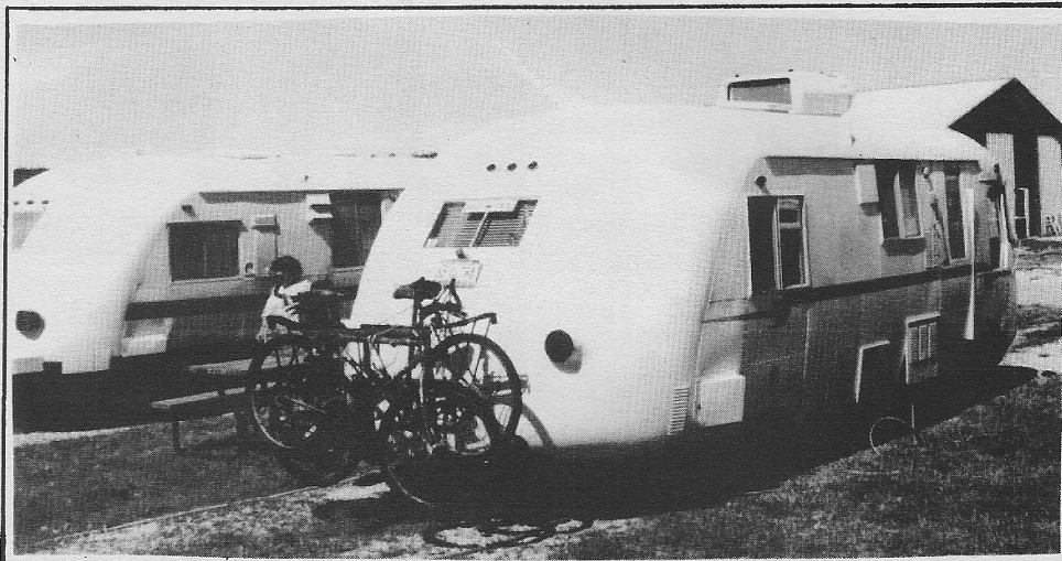
Here is Doug and Nancy Pratt's Ultra Van S/N 373 with the lovely white oak interior. They usually carry a pair of bicycles on a rack attached to the trailer hitch so they can explore their surroundings without disconnecting each time. The fresh air and exercise is a very good side benefit too.

You may have discovered that you can see a lot more of the local scenery by walking or riding a bike than if you are riding in a taxi or driving a car. Check with the Pratts to see how they attach the bike carrier to their Ultra Van.