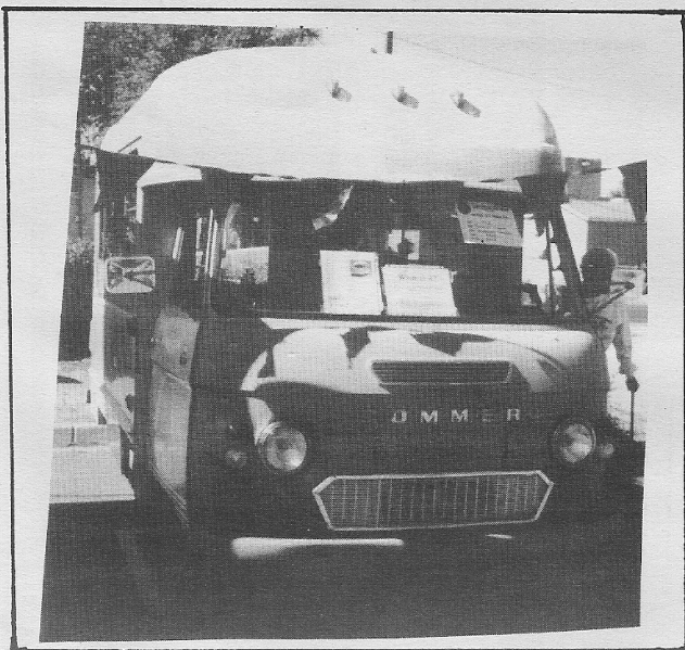
DO YOU KNOW WHAT THIS VEHICLE IS ?

In the last issue of Whales on Wheels, I showed a Model T Ford, 1924 year model, and explained that I will show unusual RV's in future issues and ask our members if they can identify them. In this issue, I will give you a clue about the RV shown below. It sleeps 8 (eight) people. If you know about it, write and let your editor know so that it can be explained in the Winter 2001 issue of WOW.