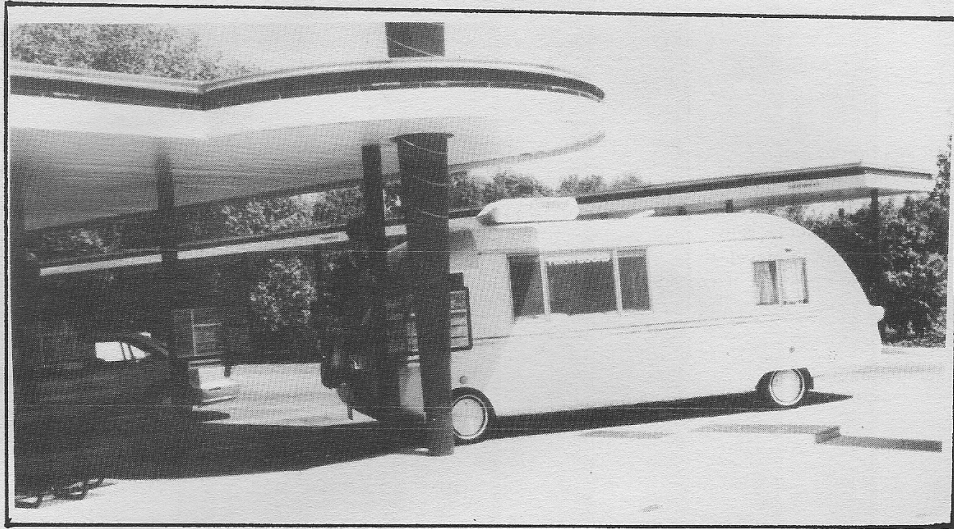
Here is our Ultra Van S/N 443 stopped under the awning at a Sonic Drive In in Pratt, Kansas, just 60 miles south-west of where Ultra Vans were built in Hutchinson, Kansas. After we ate lunch here on the way to Amana, Iowa, we drove to Hutchinson, Kansas and drove by the airport where the Ultra Vans were manufactured. One of the Many good things about owning an Ultra Van is that you can drive them almost anywhere that you can drive a car or van because they are compact.

On our un-eventful trip home, we experienced night time temperatures in the mid-thirties, and of course, I had forgotten to install the heater hoses before the trip!