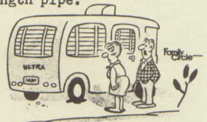
"Taking care of the house is your job"

THANK YOU: Your editor again says, "Thanks" to those who sent in material or suggestions for the CLUB NEWS issues the past year. Many of you have swapped tales on actual experiences, maintenance, modifications, malfunctions, techniques, ideas. We haven't been able to write them all up yet... most have been. Thank you again. Based on frequent comments, the information in these newsletters must be priceless to many of the members; the only other way to get it would be to personally know more than 100 UltraVan owners and caravan with them continually. This has become, for us too, a valuable education.